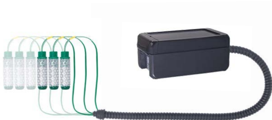
The PiCUS Tension can be equipped with up to six robust sensors.

When using the LTE radio standard, the measurement data is stored in the PiCUS Environmental Cloud and can be viewed daily via the PEC app or the browser-based application. The location of the cloud server is at IML Electronic in Rostock. This expands the evaluation of measurement information through individual export functions. With the LoRaWAN® equipment variant, the measurement data is sent from the PiCUS Tension to the user's own LoRaWAN® network and can be retrieved there.